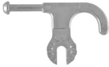
Disconnect hook (HOK-HS166)